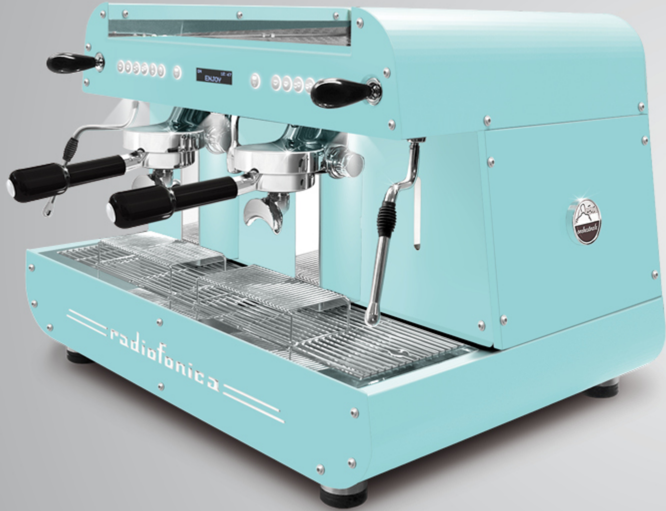
All blue Tiffany