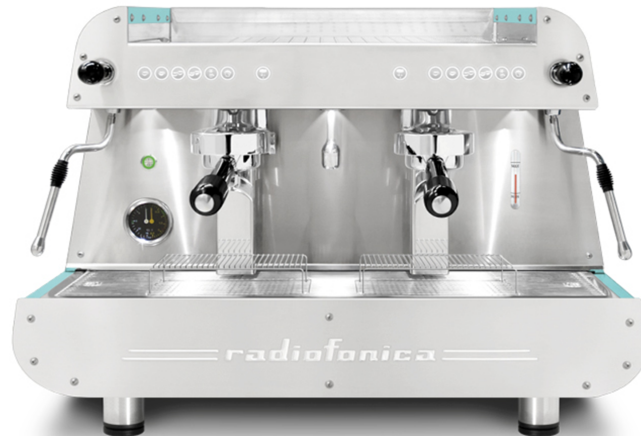
Basic with 1 purge button per group