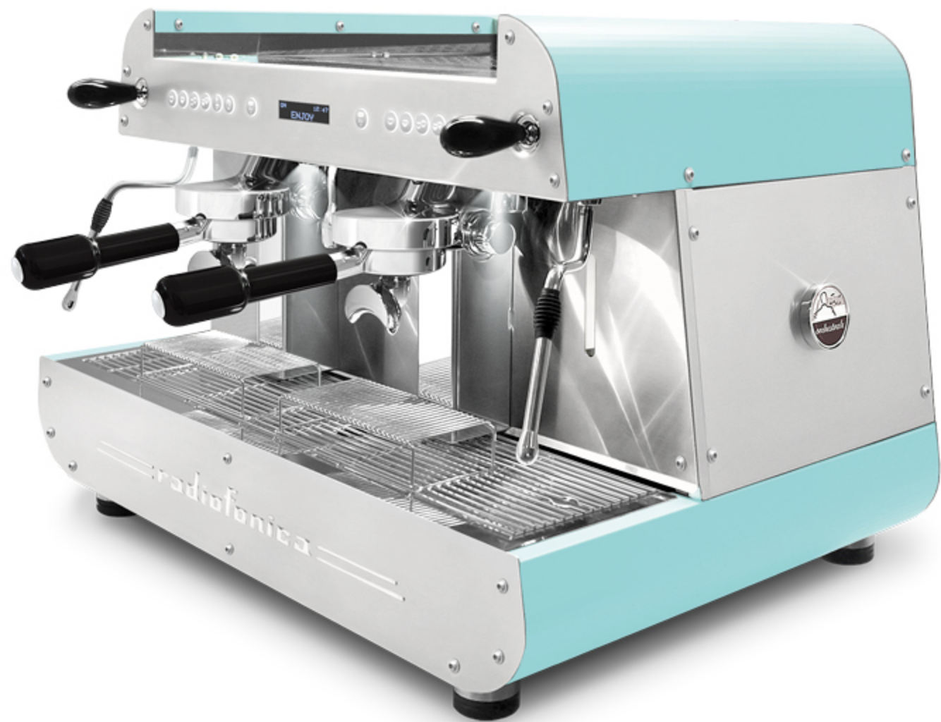
steel painted blue Tiffany